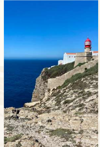
Lighthouse in Sagres, Portugal

From crossing the Strait of Gibraltar to swimming in Southern Portugal, I've done unimaginable things that have left me inspired me to seek greater. I've formed so many valuable friendships and built a new life in a city so passionate and free. Although I came here alone, I leave connected to peers from all over the world, each with their own fascinating story to tell. Living in a different country showed me that the world truly is so much more extraordinary than I ever could've visualized.