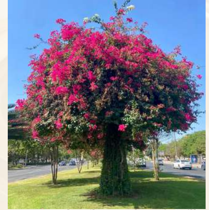
The vibrant colors of Seville

As my time in Sevilla comes to an end, I realize how grateful I am that my past self made the leap to study abroad. Several months ago, I stopped into my college's international studies office after seeing signs around campus and asked several questions about the programs offered. Once I learned about studying in Spain, I couldn't get the idea out of my head and worked tirelessly on my application. While I had generally envisioned gaining independence and improving my Spanish-speaking abilities, I ended up having one of the greatest months of my life with memories that will last forever.