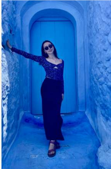
In the blue city of Chefchaouen

From crossing the Strait of Gibraltar to swimming in Southern Portugal, I've done unimaginable things that have left me inspired me to seek greater. I've formed so many valuable friendships and built a new life in a city so passionate and free. Although I came here alone, I leave connected to peers from all over the world, each with their own fascinating story to tell. Living in a different country showed me that the world truly is so much more extraordinary than I ever could've visualized.