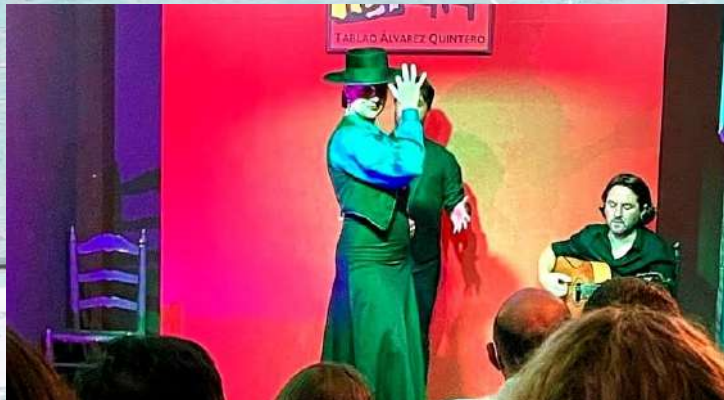
Night of Flamenco song and dance