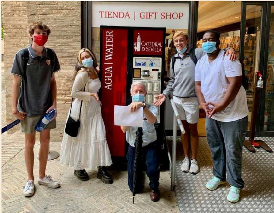
Visit to Seville's Cathedral