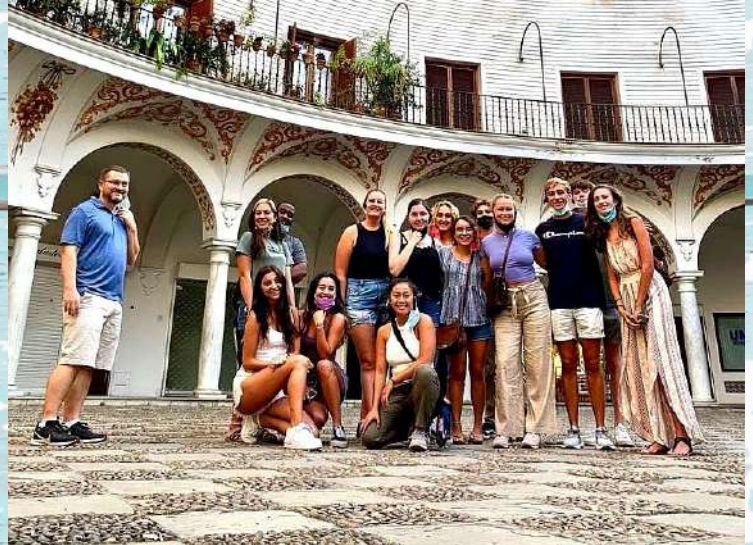
Night walk of "Curiosities & Legends"