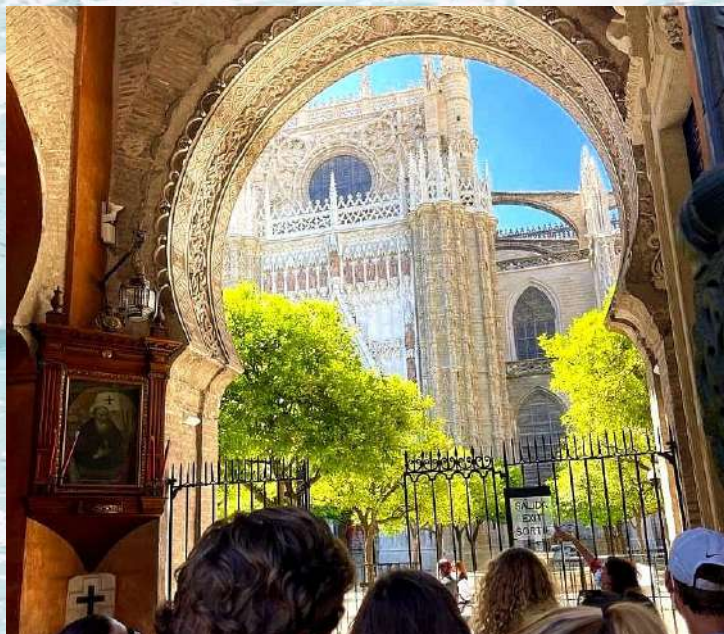
Walk through historic downtown and shopping district