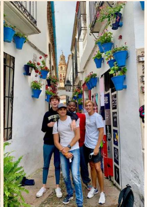
In the Flower Alley of Córdoba

One month. Four weeks. 32 days. 768 hours. In this short amount of time, I have travelled more, seen more, experienced more, and said 'yes' more than I did during my entire Spring semester in college. After my study abroad was cancelled due to COVID, I was offered spots in programs all across Europe, including Germany, Italy, and France. I am so glad I made the decision to come to the south of Spain. The people I have met and the memories we share validate my choice, and if I had to do it over again, I wouldn't change a thing.