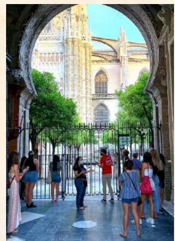
At the Cathedral