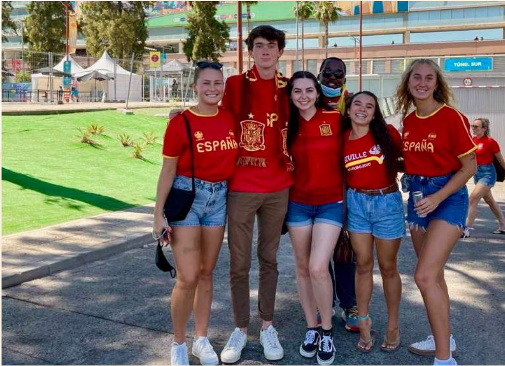
At the Spain -Slovenia game of the Eurocup