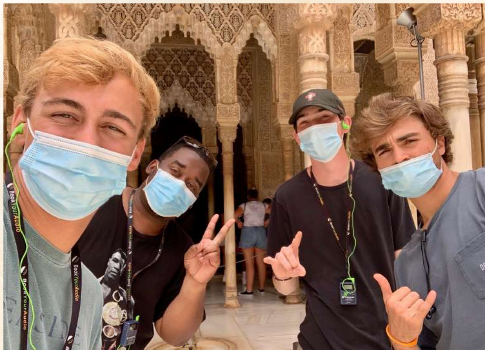
In the Alhambra palace of Granada