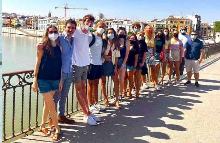
Walk to Triana

Because of the pandemic, it had been too long since we could celebrate the arrival of our new students. With great pleasure we introduced our Summer students to Seville. And what fun we had!