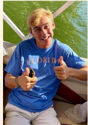
Celebrating my birthday