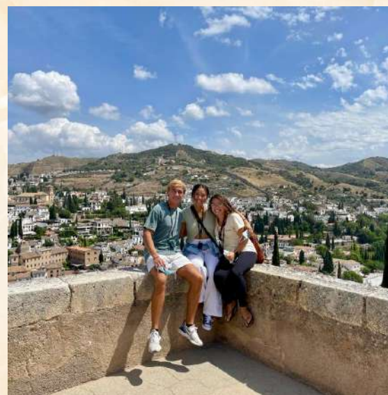
Admiring the views in Granada

Along with classroom instruction, on-site visits were also part of our courses. We visited the Alcázar, Cathedral, Military Museum, and the ancient Jewish Quarters of the city. Our instructors acted as tour guides, telling us all about the history and lore of each place. We also had extended trips to the cities of Córdoba and Granada. Equipped with sack lunches from our house moms, we toured the cities as a class and experienced the different aspects of Andalusian cities. In Granada, we had the opportunity to explore the Alhambra, a centuries-old fortress that served as the headquarters for the Muslim occupation of Spain. Granada was easily my favorite excursion of the program.