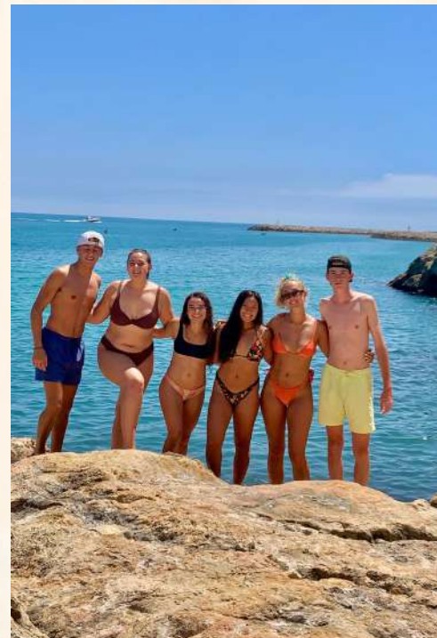
On the beach, in Portugal