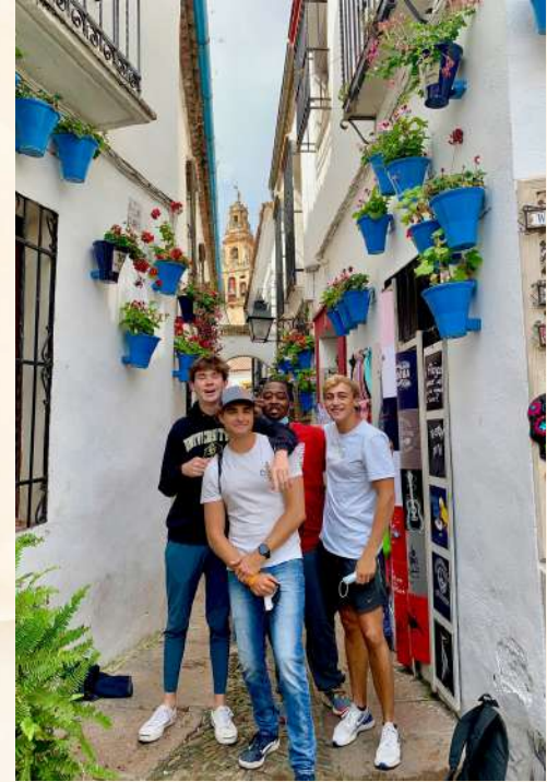
Visiting the city of Córdoba

When we weren't in class or on school trips, there was never a dull moment in Sevilla. As a group, we always had something going on, whether it be kayaking on the river, enjoying rooftop tapas bars, or simply spending time with our host families. For our free weekend, we all came together and planned an amazing trip to Albufeira, Portugal. There, we enjoyed the beach, ate at amazing Portuguese restaurants, and even watched England play in the Euro Cup with a group of Brits. It was amazing to be able to travel to a completely different country in just a weekend.