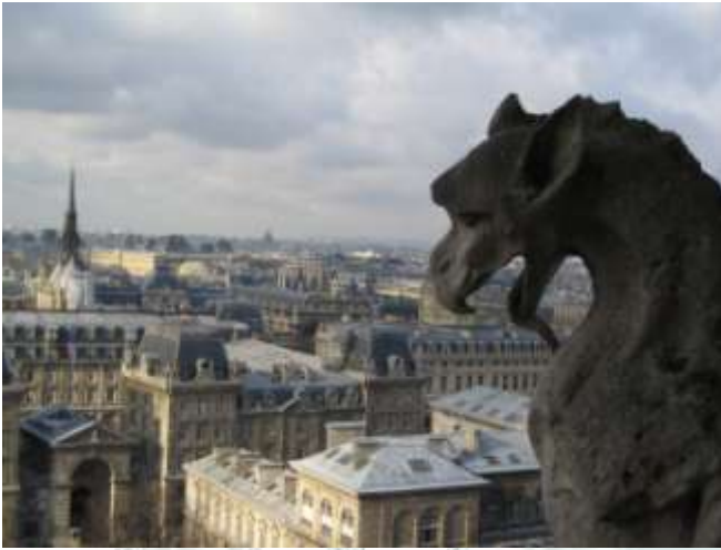
Is this Paris?

Resident Director, Paris, France, Fall 2016, Spring 2015, Fall 2009, Summer 2005