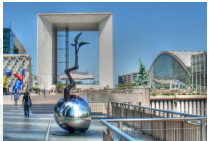
Or is this Paris?

The correct answer is that both locations are indeed Paris!