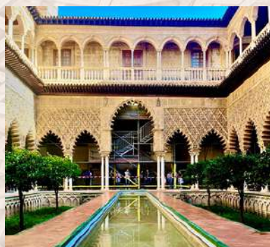
The Maidnes' Court, in the Alcázar palace