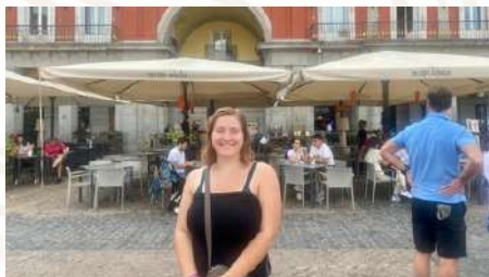
Enjoying solo travel in Madrid

And thus, I did something I never thought I would: I took a solo trip. I hopped on a bus, hopped off that bus, and stumbled, blinking, into a deeply beautiful city where the historic relics of a long-dead kingdom rested casually and commonly next to modern buildings. For only 16 euro, I purchased a ticket to see the Roman circus, theater, amphitheater, place of worship, and funeral areas. It was wonderful. I learned everything I hoped I would, and I was stunned and in awe by the remnants of this brilliant land, and more than that, I realized something absolutely mind-blowing: this was manageable. Small adversities like the bus being late or my phone needing more power weren't as intimidating as I thought they would be. With my entrance ticket and portable charger in hand, I could conquer any ancient empire.