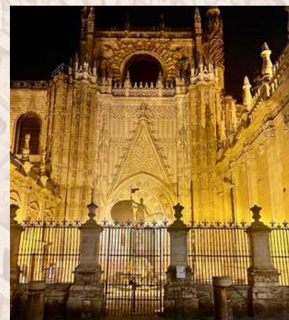
Seville's Gothic Cathedral

As part our cultural immersion at ICS, one of the field trips we will be going on is to the Seville Cathedral and if you ask me, it is one place that should be on everyone's list. Not only is it the largest Gothic cathedral in the world, but it's also a marvel of art & architecture and an iconic part of the city's skyline. The awe-inspiring interior, stunning stained glass, and famous Giralda Tower make this cathedral an absolute must-see. Don't forget to climb the Giralda Tower for panoramic views of the city.