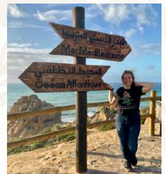
In Cape Spartel, Morocco

In order to describe my Morocco experience, I need only one sentence: Yes, I did ride a camel! Everyone was equally enamored with that concept, their eyes lit up in wonder, and for good reason. It may sound silly, but I genuinely could not stop giggling the entire time. I was just thrilled. I'm just so grateful I got to witness this small piece of Northern Africa through the ICS program. I never thought it would be something I would get the chance to do.