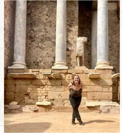
In the Roman theater, in Mérida

While taking notes in my Art History class at the beginning of the month in October, a name of a particular city kept coming up: Mérida. The capital of the neighboring province of Extremadura, this humble city of 60,000 people was and is still famous for one very intriguing phenomenon: Roman architecture. I, of course, only had the vaguest notion that the Romans had existed in Spain at all, let alone that they had such an influential and dominating presence, so the prospect of getting to see the remnants of a brilliant world was hugely intriguing to me. And when would I ever be this close to Mérida again?