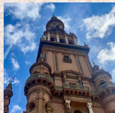
North Tower of the Plaza de España

The experience at Plaza de España can be described as stepping into a movie set or history. It's the kind of place that, for me, felt like stepping into another world. Its sheer beauty is striking, with its stunning architecture, ceramic-tiled alcoves, and an overall sense of grandeur. Speaking of movies, you might recognize Plaza de España from famous films like Star Wars and Lawrence of Arabia .