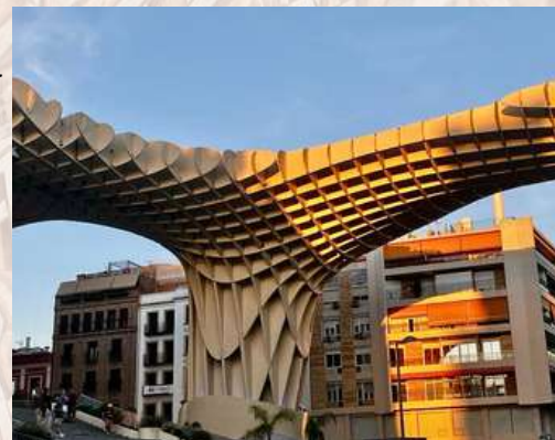
Las Setas de la Encarnación

While Seville is steeped in history, it is also a city that beautifully blends the old with the new. A prime example of this is Las Setas monument. It is the largest wooden structure in the world. Atop this modern architectural marvel, you can catch one of the most breathtaking sunsets of your life. The views from here are absolutely mesmerizing. And the best way to enjoy this spectacle? With churros con chocolate at Bar Centuria , where ICS took us right at the very start of the semester!