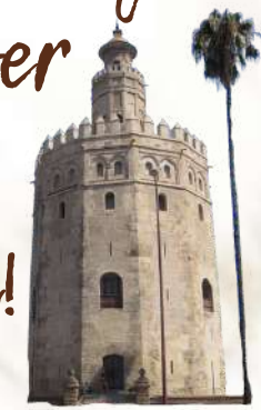
"La Torre del Oro" monument.

For our first morning we walked along the river and into Triana to enjoy a typical Andalusian breakfast.