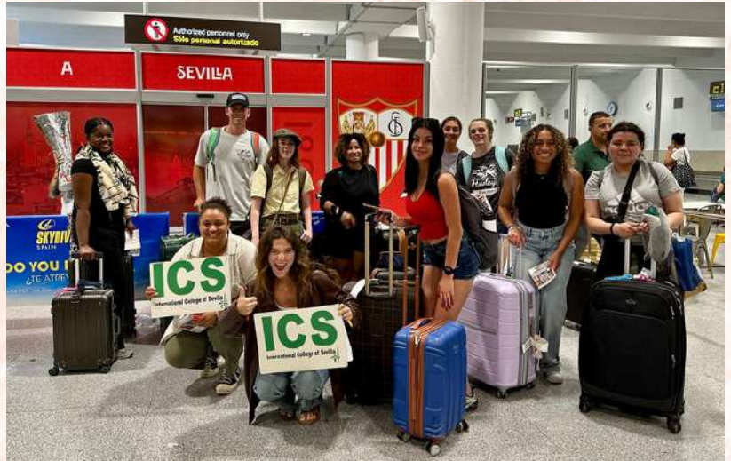
Great airport welcome reception!