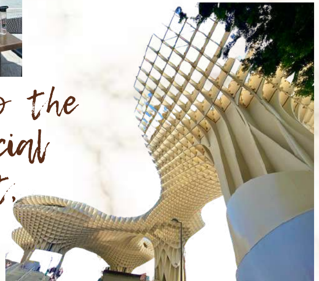
"Las Setas" monument.

Visit to the commercial district. "Las Setas"!