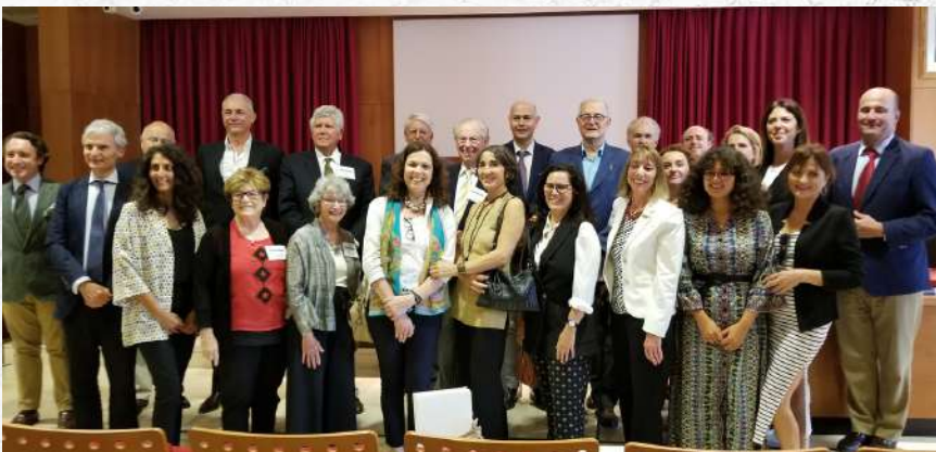
Group shot of the participants of the Forum