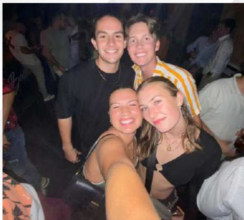
Enjoying Seville in the daytime and at night!

Over this last week I have enjoyed spending time with my host mom and my roommates. She makes us amazing food and we are excited to see what other new foods we will yet try! My favorite food so far is Tortilla de Patata CON cebolla. I am super thankful for this experience, and hope to fully immerse myself in Spanish culture and traditions. In the upcoming weeks we will have a day trip to Córdoba, a weekend trip to Portugal, and a three-day trip to Morocco, which are all going to bring this group even closer together and make this an experience we will all remember for ever.