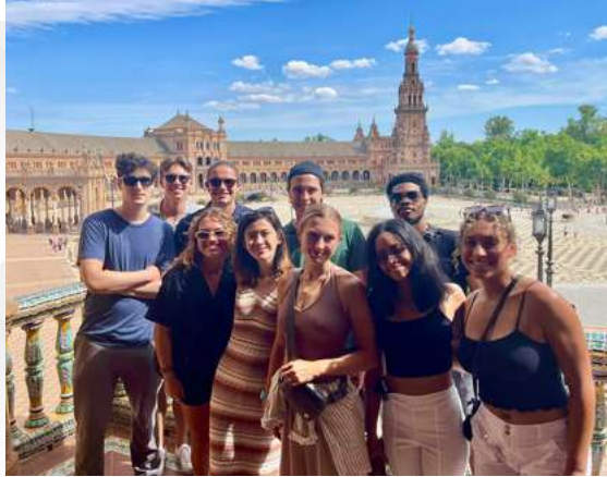
Exploring the María Luisa park with my new friends

As I was sitting at the Paris airport waiting for my next flight after over 24 hours of travel, it finally dawned on me that I was in a new country on my way to study abroad. The process was taxing, but of course in the end, absolutely worth it. It can be overwhelming...the idea of being away for a long period of time, not knowing anyone, and just waiting patiently for the flight to land already so you can stop being wedged in-between two people. But as the first week rapidly came to a close, we can see the love, friendship, and culture that radiates from this wonderful city.