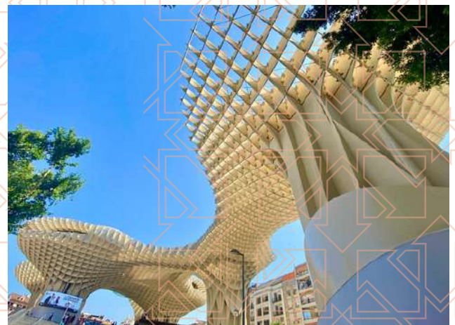
"Las Setas" monument.

If you snooze in Sevilla, you won't lose: the mid-evening siesta remains a prominent part of local culture. Following lunch, we're given the opportunity to escape the bright sun and rest for a long night ahead. While strange at first, I've really enjoyed exploring this new lifestyle where Spanish families eat dinner late at night and stay awake long past traditional American daytime hours. It's been interesting to see Spaniards from all walks of life out celebrating in the streets past two or three in the morning.