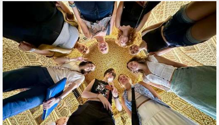
Visit to the Alcázar palace..

Each day was filled with new food, new people, and new experiences and I am excited to see what follows within the coming weeks. Just a few days ago, we visited the Alcázar palace, which is the oldest active royal palace in Europe. The Spanish royal family still uses it when they come to Seville. The history and contrast of cultures and religions spanning hundreds of years was incredible to see and learn about.