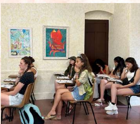
During ICS Orientation