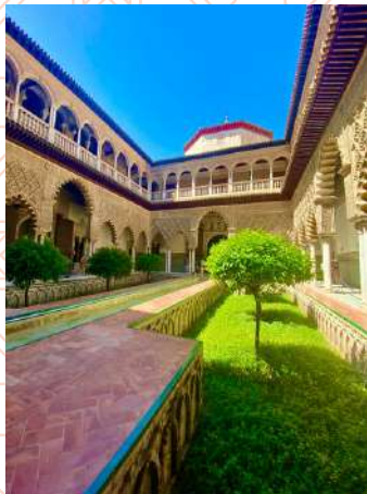
The Alcázar palace..

By applying to study abroad, I've welcomed a world of opportunities and lifelong connections. Immersion in Sevillian life is a valuable way for me to expand my horizons and gain valuable experience. I've experienced a wonderful sense of fulfillment from sharing life's joys with like-minded students in a country that indulges in each passing moment. I hope to continue to enjoy studying in the green, accessible Andalusian city of Sevilla.